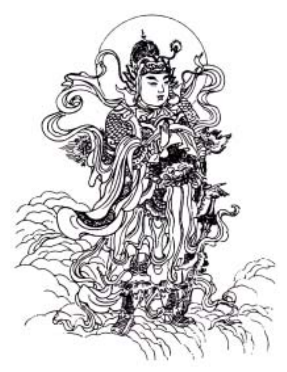
Dharma Protector Wei T'o Bodhisattva